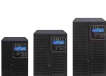
AR PLUS Tower 1000VA - 3000VA