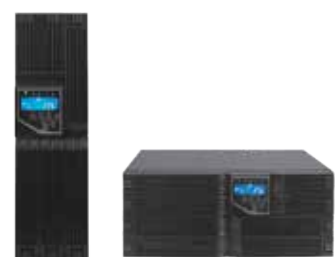
OD H 1000VA - 3000VA