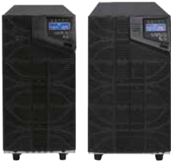
MSIII Tower 6000VA - 10000VA