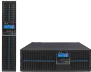
MSIII RT 1/1 6000VA - 10000VA