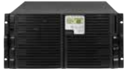
MSII RT 3/1 10000VA - 20000VA