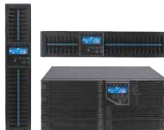
AR PLUS RT • OD PLUS 1000VA - 3000VA